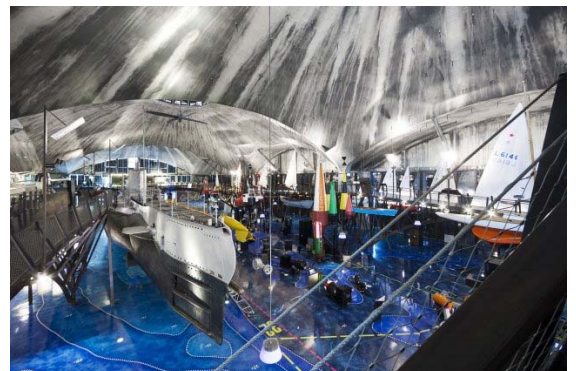
Lennusadam Seaplane Harbour Museum, Tallinn, with large concrete shell structures build originally 1916-1917.