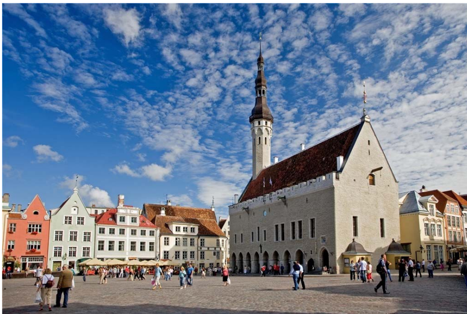
Central plaza of the city of Tallinn, Estonia.