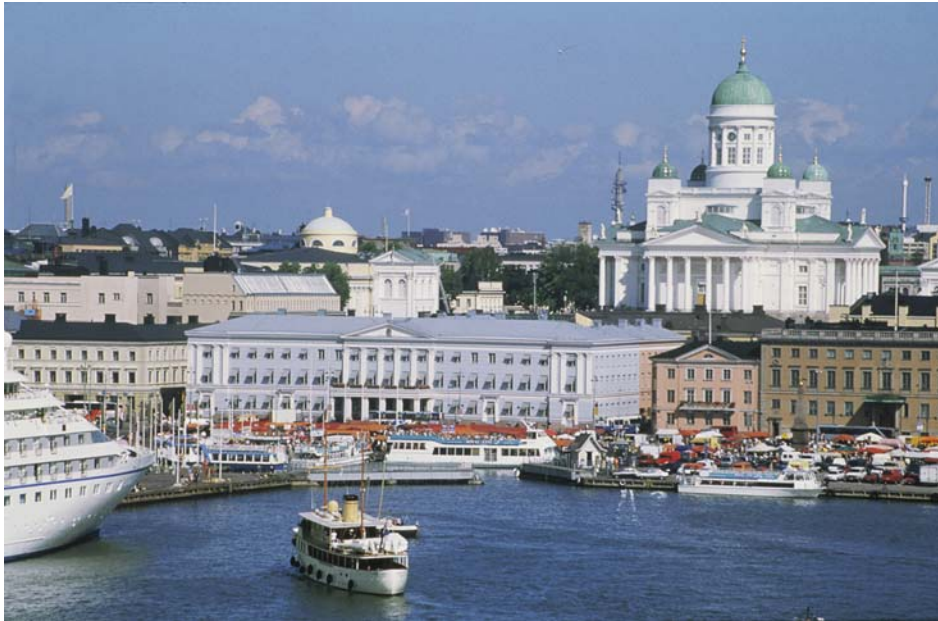
Market square of the city of Helsinki, Finland, as photographed from the South Harbour.