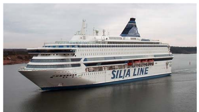
M/S Sija Europa.

Finland and Estonia are both countries of European Union and belong to Shengen area. Nationals of the Shengen countries do not need a visa to enter Finland or Estonia. When entering to Finland or Estonia, passengers are required to have proof of identity, such as valid passport or official ID card with photo.